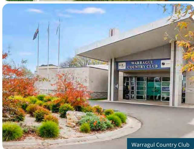
Warragul Country Club