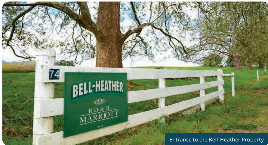
Entrance to the Bell-Heather Property

In the snow season, it's only a 90-minute drive to take on the slopes at Mount Baw Baw. Meanwhile, family fun is abundant year-round at Gumbaya World less than half an hour away — the waterpark, rides and wildlife park are guaranteed to entertain all ages.