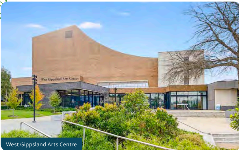
West Gippsland Arts Centre

For those who have a keen interest in the arts, there are numerous art galleries, craft markets and live