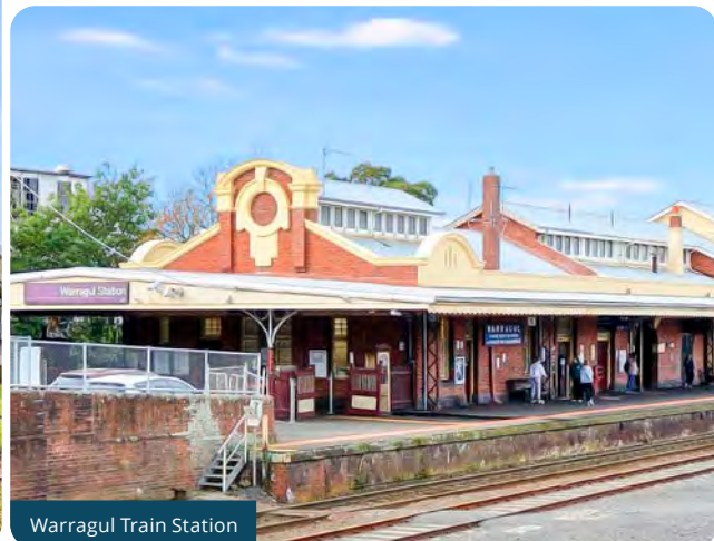
Warragul Train Station