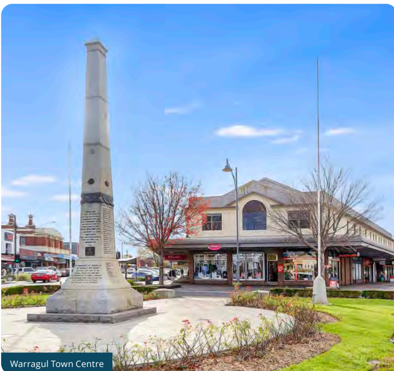
Warragul Town Centre